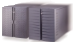
Optional black color